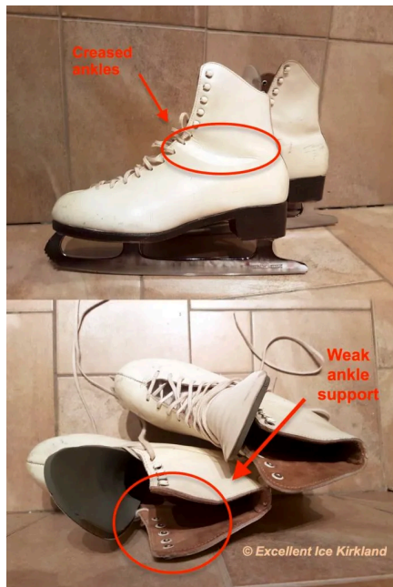
Figure skates are mandatory. Skaters at this level should be in a sturdy boot with a quality blade. Sharpening should be performed by a trained professional.

We highly recommend purchasing figure skates and getting them sharpened from ProSkate. We have found they have the most experienced and knowledgeable staff there. As a second option, United Cycle also sells and sharpens figure skates.